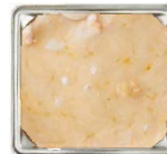
UWCSB Blended w/Gochujang