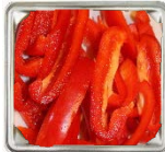
Red Bell Pepper