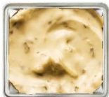
UWCSB Blended w/Jerk Seasoning