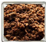
Jerk Seasoned Ground Beef