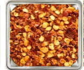
Crushed Red Pepper