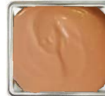
UWCSB Blended with Pizza Sauce