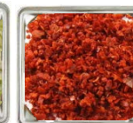
Red Pepper Flakes