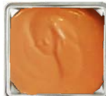
UWCSB Blended with BBQ Sauce