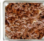
Seasoned Ground Beef