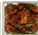
Korean Seasoned Tofu