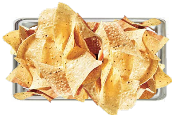
Jamaican Jerk Nachos