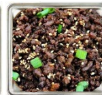
Korean Seasoned Beef Crumbles